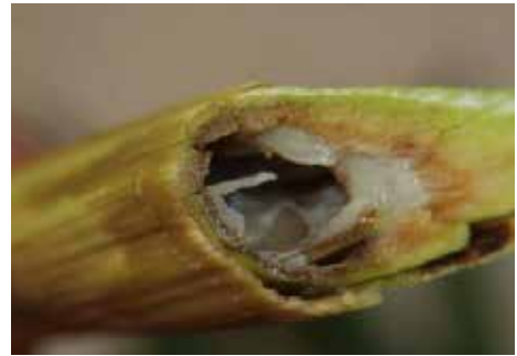
Figure 8: Severe stalk decomposition from the wilt phase of Goss's Wilt (Malvick et al., 2018)