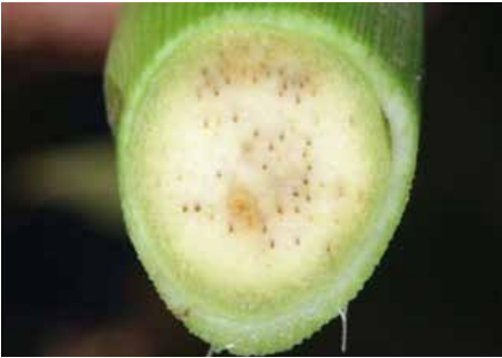
Figure 7: Discolored stalk pith indicative of the wilt phase of Goss's Wilt (Malvick et al., 2018)