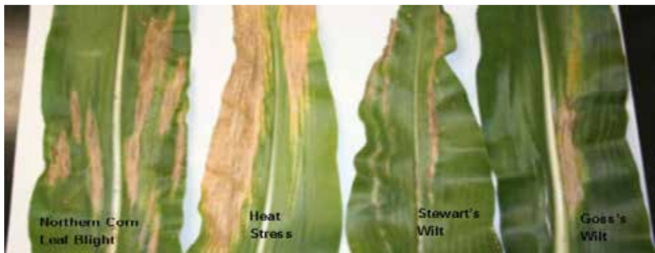
Figure 10: How to distinguish Goss's Wilt symptoms from other leaf necrosis (Jackson, 2007)

Drought (heat) stressed maize, maize infected with Northern Corn Leaf Blight (NCLB) ( Exserohilum turcicum ) and Stewart's wilt ( Pantoea stewartii ) have similar symptoms to those caused by Goss's Wilt. However, these symptoms can be distinguished. The drought stress causes brown discoloration from leaf scorch that tends to be more uniform in colour, and the necrotic leaf tissues do not have the water-soaked freckles, shiny bacterial or the bacterial streaming associated with Goss's Wilt lesions. NCLB can be distinguished from Goss's Wilt by the lesion's canoe shape, even lesion margins, and the absence of freckles in the lesions and bacterial streaming, which are observed in Goss's Wilt. Goss's Wilt and Stewart's wilt may both cause seedling blights that kill young plants, lesions that develop into long lesions with wavy margins that extend between veins, however, a key distinguishing characteristic is the dark green-to-black freckles that develop with Goss's Wilt lesions ( Figure 9 ).