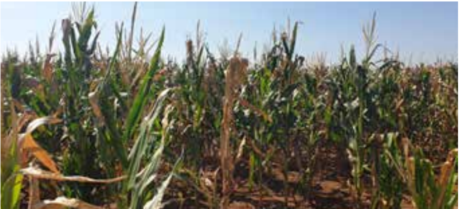
Figure 9: Plant wilting and dying is characteristic of Goss's Wilt (Flett, 2024)