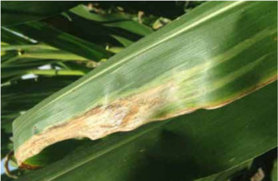
Figure 2: Typical Goss's Wilt lesions on a maize leaf (Malvick et al., 2018)

On the other hand, the systemic wilt phase is less common and is often first observed in the early vegetative stages of growth (corn growth stages V2–V6). When the wilt phase develops, the infection may discolour xylem tissues or cause a slimy stalk rot, which is followed by wilting and plant death ( Figures 7–9 ). Systemically infected plants may wilt and appear drought stressed. Maize plants may have weak stalks and an increased susceptibility to lodging.