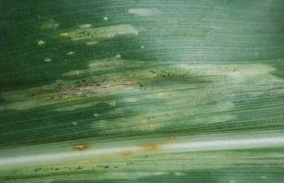
Figure 3: Early Goss's Wilt lesion showing light green lesion developing with water soaking, grey/green margins, and dark, water-soaked freckles (Malvick et al., 2018)