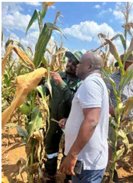
Figure1: Sampling by DALRRD officials (Mthembu, 2024)

Goss's Wilt is caused by the Gram-positive bacterial species Clavibacter michiganensis subspecies nebraskensis . It was first found on two farms in south central Nebraska (Dawson County) near Lexington in 1969 (Wysong et al. 1973). Initially, epidemics were restricted to Nebraska and parts of Colorado, Kansas and South Dakota. Between 2009 and 2011 it was reported in the following states of the United States of America: Iowa, Illinois, Indiana, Minnesota, and Wisconsin. Major epidemics led to leaf loss, lower stalk quality and reduced yields (up to 50% losses). The first symptomatic plants received also showed symptoms of Northern Corn Leaf Blight. Goss's Wilt was not known to occur locally and initial testing (PCR and sequencing) was done and found to be positive for the bacterium. Additional sampling from various localities stretching from north of Parys, across Fochville, Carletonville to Lichtenberg was done. The Department of Agriculture, Land Reform and Rural Development (DALRRD) was then informed, and subsequently, samples were collected by DALRRD officials from farms in the Potchefstroom area (Figure 1). The samples were sent for identification at the Agricultural Research Council (ARC) in Pretoria. Clavibacter michiganensis subsp. nebraskensis was also confirmed by molecular methods (PCR and Sequencing).