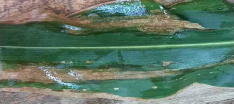
Figure 6: Dried bacterial ooze on the surface of lesions appears shiny (Njom, 2024)