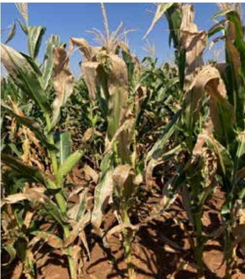
Figure 4: Goss's Wilt can kill large areas of leaves, thereby reducing chlorophyll activity and subsequent grain fill (Flett, 2024)