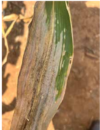
Figure 5: Dark, water-soaked spots ("freckles") Goss's Wilt lesions. The water-soaked spots appear translucent (Mthembu, 2024)