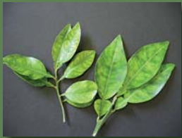
Typical blotchy mottling symptoms of citrus greening on citrus spp

Treating affected trees with injections of antibiotics alleviates the symptoms, but does not cure the diseased plants. Prompt elimination of diseased trees is strongly advised.