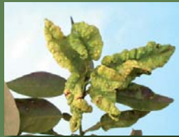
Feeding damage to citrus leaves caused only by the African citrus psyllid, Trioza erytreae