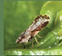
Adult Asian citrus psyllid