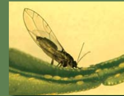
Adult of the African citrus psyllid